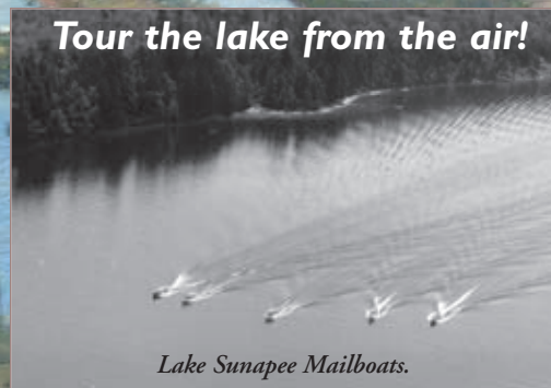
Lake Sunapee Mailboats.