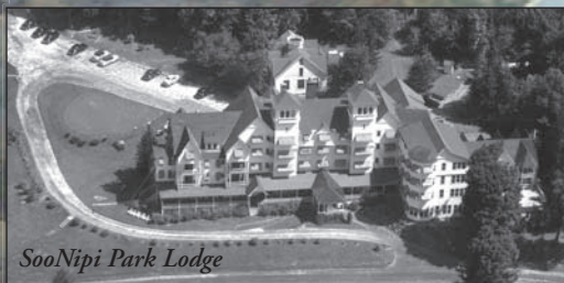
SooNipi Park Lodge

SooNipi Publishing has scanned these 5"x7" black & white negatives at a high resolution for reproduction size and painstakingly cleaned up scratches and imperfections to produce high quality reproductions. Large prints may be ordered of individual photos.