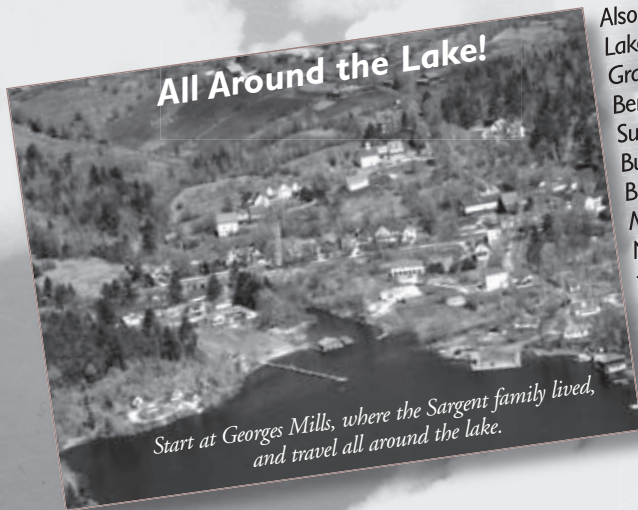
Start at Georges Mills, where the Sargent family lived, and travel all around the lake.

Also: See Fernwood, Lake Sunapee Yacht Club, Granliden Hotel, Ben Mere Hotel, Sunapee Harbor & Village, Burkehaven, Baypoint, Edgemont, Mt. Sunapee area, Newbury Harbor, the old railroad tracks, the Islands, Blodgett's Landing, SooNipi Park, and more!