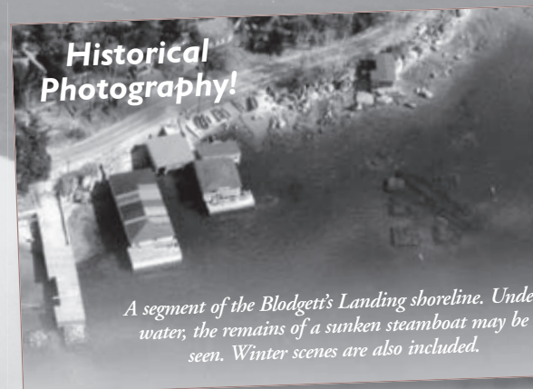
A segment of the Blodgett's Landing shoreline. Under water, the remains of a sunken steamboat may be seen. Winter scenes are also included.

The Sargents flew all year-round, giving different perspectives on the changing landscape. In the winter, there are scenes of ice damage on boathouses, evidence of cutting ice at Sunapee Harbor, and watching the ice thaw in the spring. Even within this two year period, major changes may be seen.